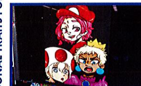
3D ANIMATION TECHNOLOGY