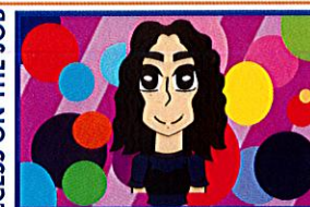
COMMERCIAL ART TECHNOLOGY